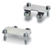
Adapter insert, type: D25

Adapter insert - HC-CIF-D25-AIWS-SM-NI - 1424341